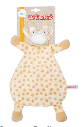
Buttercup Giraffe WubbaNub Lovey