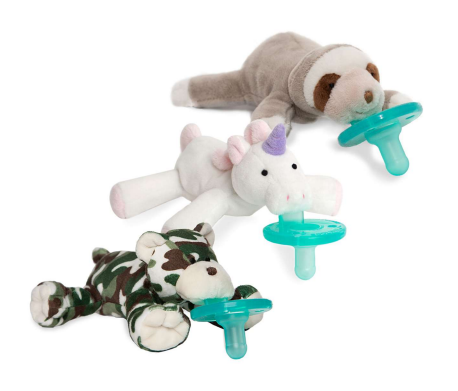
Camo Bear, Blush Pink Unicorn and Baby Sloth